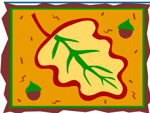
Friendly Committee extends the Welcome Mat

have not paid their 2009 dues. This is a reminder that they are payable now. Please bring to the next meeting or give me a call at 703-437-0862.