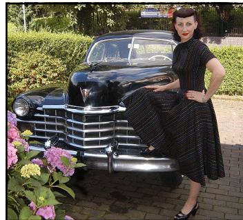
Classic Auto Show Sept, 13 2009

See more information and how you can help, on page 4, Membership.