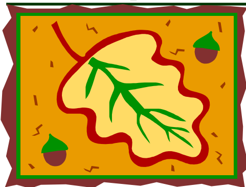
Friendly Committee extends the Welcome Mat